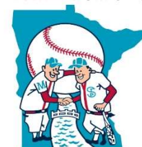
17. MLB from 61-86