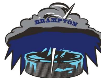
19. CWLH from 2011-2016