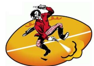
20. NFL from 1946-64